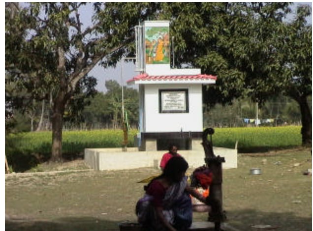
Picture 5: APROBEC Arsenic Removal Filter near the Sevak Palli School in Kamdebkathi

It is also shown that within a distance of about 1300 ft there are four options providing arsenic safe water. The density of population in this particular area is high hence Project Well implemented two dugwells in May/June 2003 upon the request of the villagers. Within six months another NGO installed an arsenic removal filter manufactured by a Japanese concern, APROBEC, with an improved set up shown in picture 5. The users of dugwell #PW8 were approached by the field workers in connection with the APROBEC filter about the overall desire of the filter. They cannot tolerate the chlorine odor that is in the water between 2-5 days, based on the duration of aeration, after application of the disinfectant. Some villagers are reluctant to change their habit. The waste of fund is not their concern.